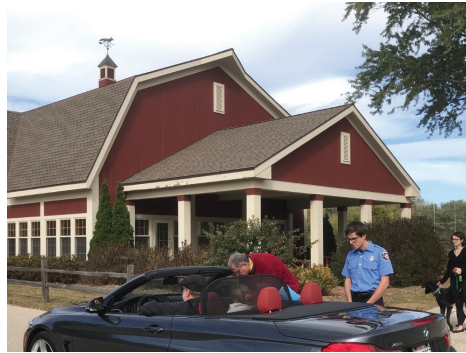
MCF Road Rally at Sommer Pavilion