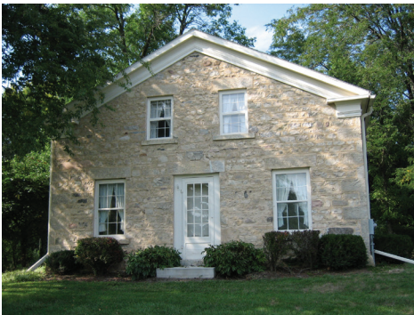
Jonathan Clark House Museum