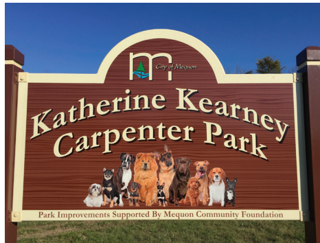
Carpenter Park Improvements